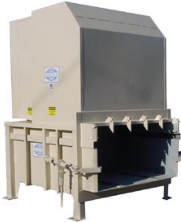
Space Saver Model